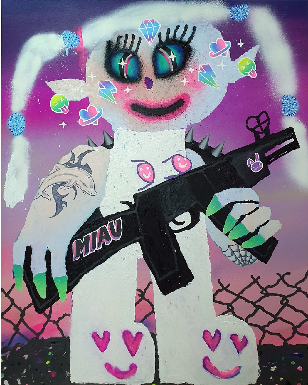
Bel Fullana Baby Killer , 2022 oil and spray paint 39.37h x 31.50w in 100h x 80w cm

In collaboration with IEBalearics (@iebalearics)