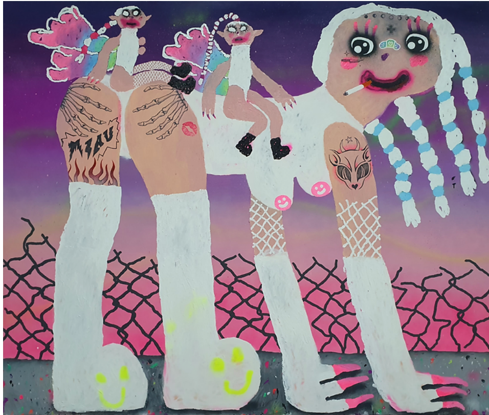
'Bamby', 2021 Oil and spray on canvas 151x179cm