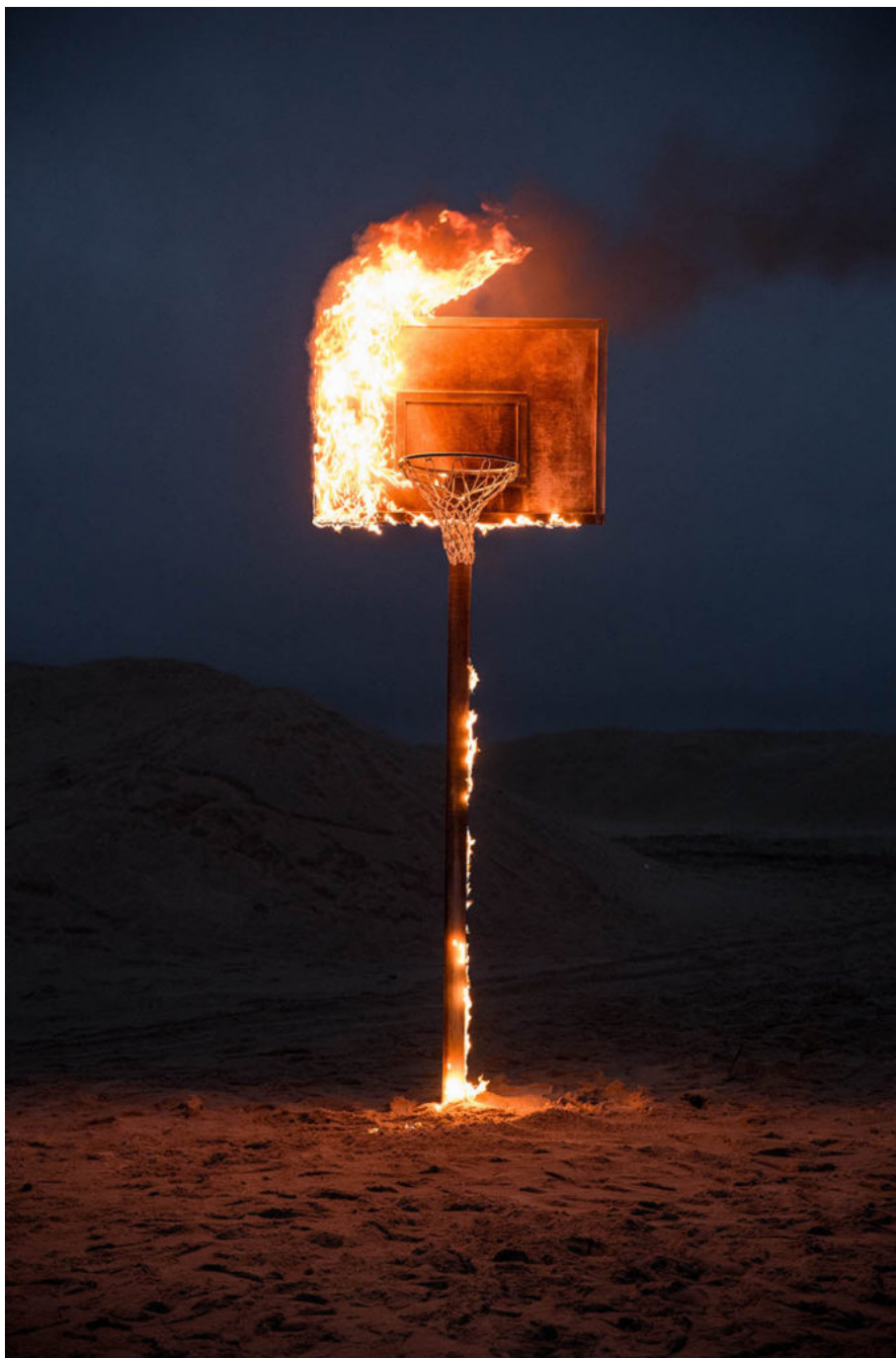
New York Sunshine, courtesy of Stems Gallery, Brussels and Luxembourg.

Every big international art fair worth its salt needs an alternative. In London during Frieze week, the Sunday art fair is a small fair where collectors and curators can discover younger galleries and their emerging artists, both young and old.