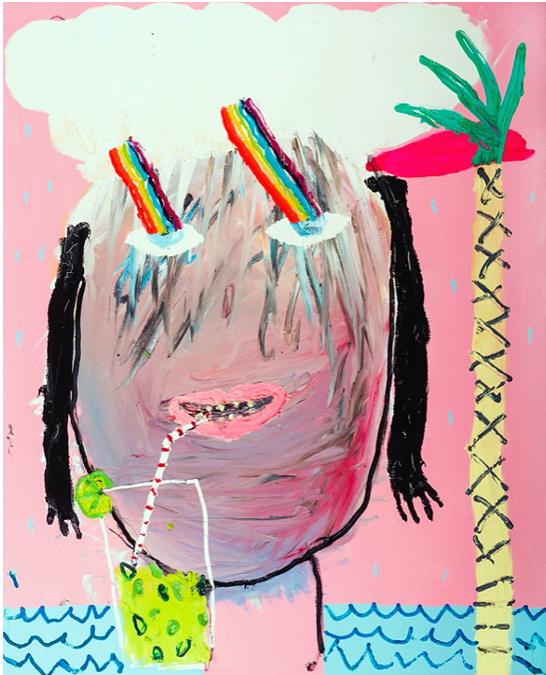
Súper Mohito Cósmico