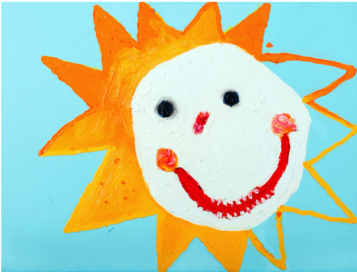
Mr. Sun Watching the Girls

Right now I have some works in the group exhibition 'Look Both Ways' that opened last week at Charlotte Fogh Gallery. In September I will participate in two group exhibitions, one in MACE in Ibiza and another in NBB Gallery in Berlin that open its doors with this show. For a little bit further on I have scheduled a project in Allouche Benias Gallery in Athens, and for next year if everything is ok with the health crisis I will be in Arco Madrid with Galería Fran Reus.