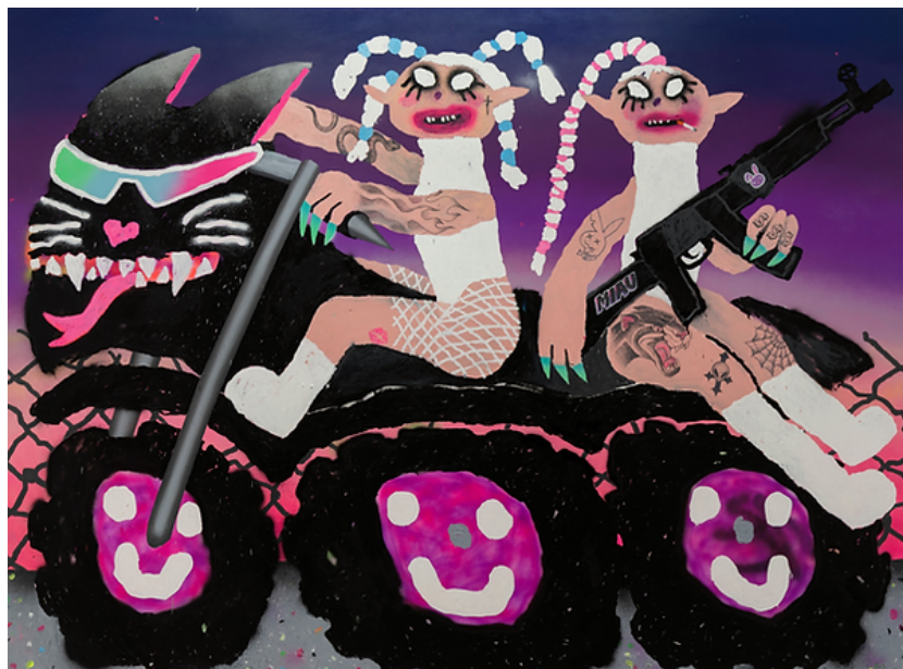
'MotoMiau', 2021 Oil and spray on canvas 130x195cm