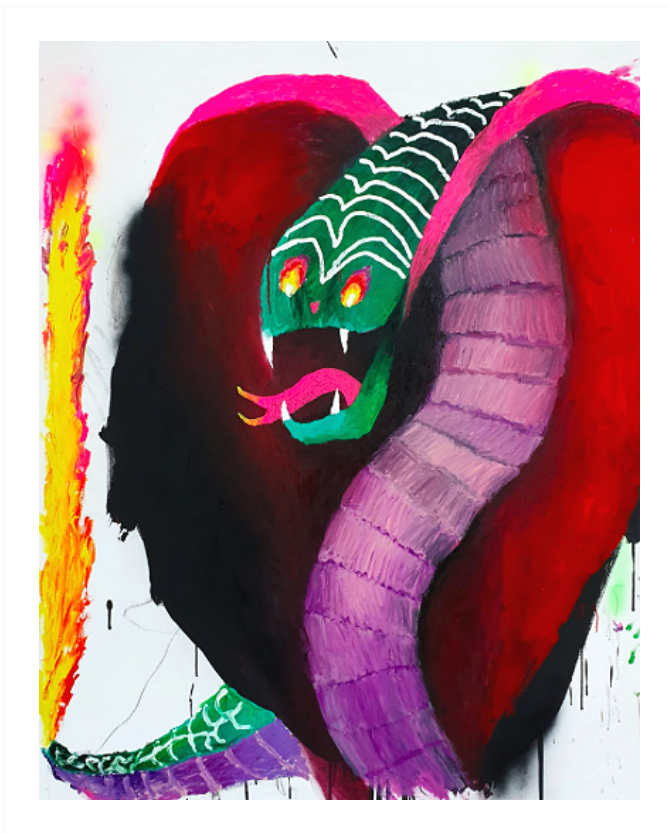
Cobra Fuego

I am very disorganized, I don't have routines. Sometimes I work during the day, sometimes at night. Sometimes I work a lot, sometimes not that much... Even though I try, I cannot maintain a routine.