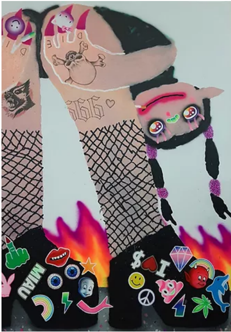
Crocs II', 2021 I spray on canvas 14cm